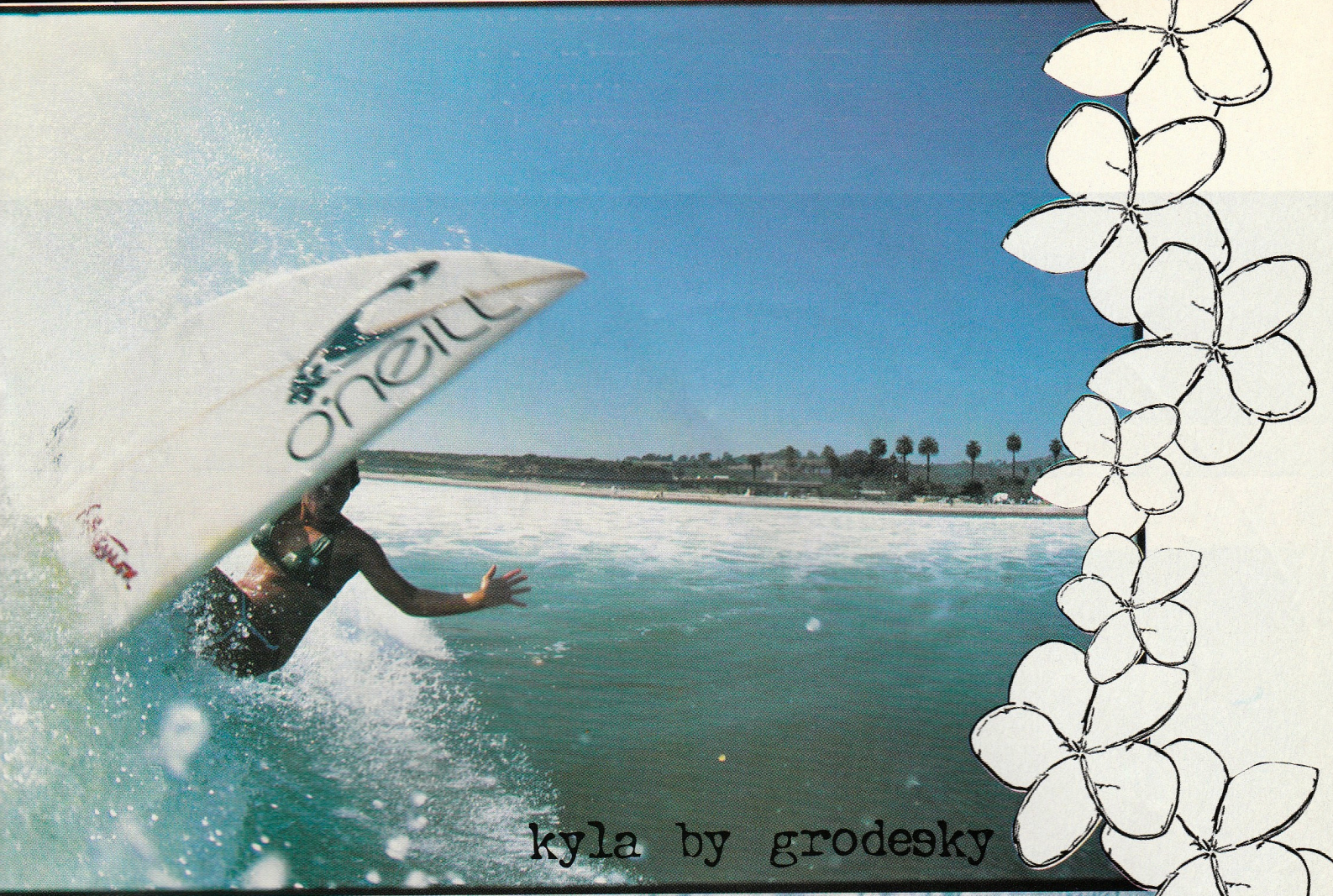
kyla by grodesky