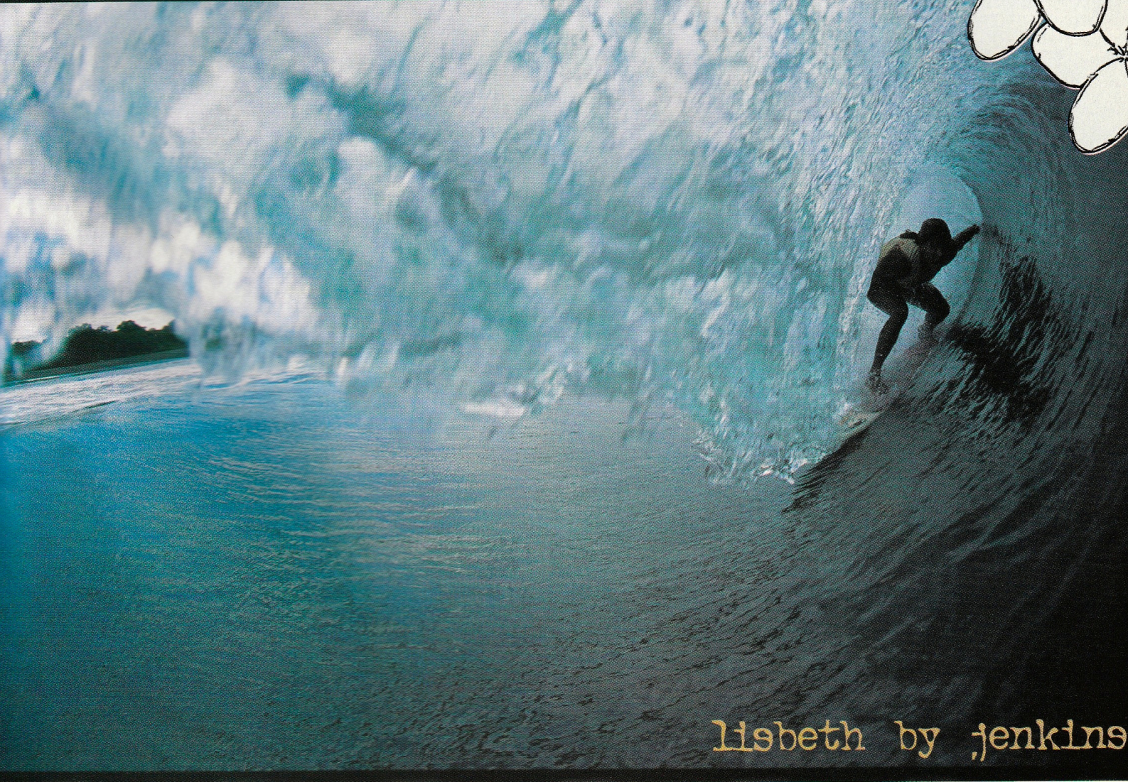
lisbeth by jenkins